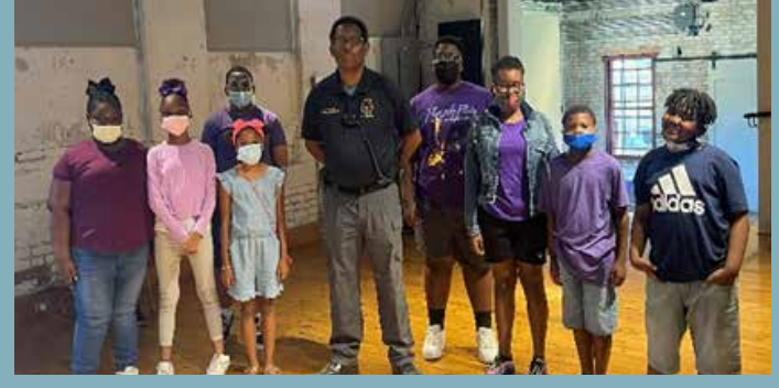
the campers on July 8th about fire safety and fire hazards.