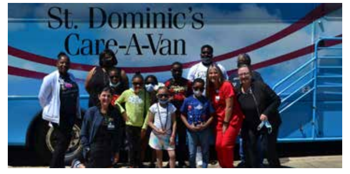
St. Dominic's Car-A-Van of Jackson, MS arrived on site June 22 for a day to provide free health screenings and feedback. Screenings included BMI, height, weight, blood pressure, heart rate, hearing, and vision.