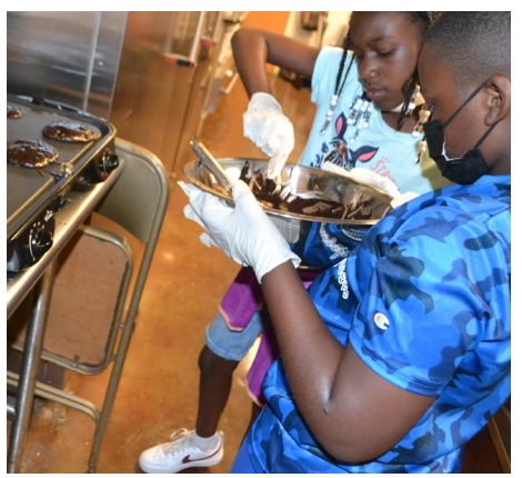
In culinary class, campers enjoyed learning and discussing what healthy living and eating looked like; here and abroad, how to prepare healthy meals and snacks, and the proper and safe way in handling utensils in the kitchen. Campers are making Dorayaki and Southeastern Rolls, popular Japanese street foods.