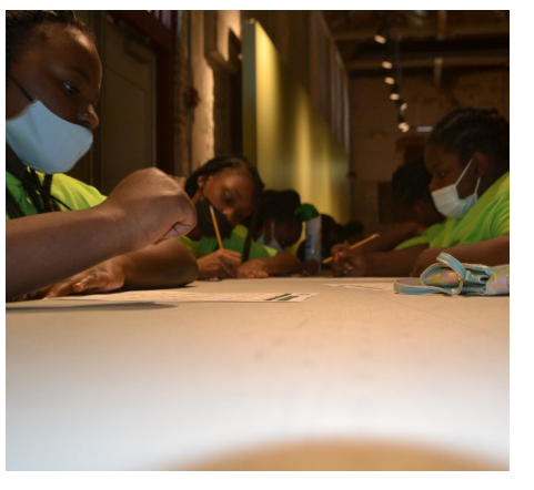
Campers expanded their knowledge through learning new vocabulary and journaling. Campers also completed lessons on new vocabulary words.

Campers observed Independence Day on July 5th by dressing out in red, white, and blue.