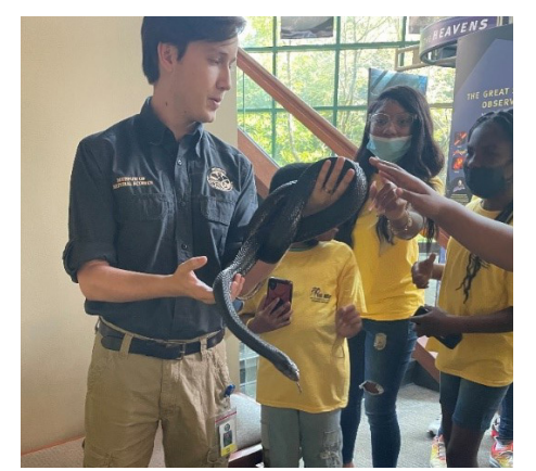
Campers traveled to Jackson, MS to the Mississippi Museum of Natural Science. Campers were able to view, interact, and learned about the unique and diverse natural resources Mississippi has to offer.