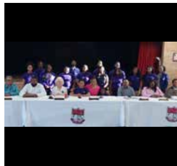
On Tuesday, April 22nd, the Ambassadors, Ambassador Coordinator and Education Director attended the Sunflower County Consolidated School District Board Meeting to observe the inner workings of school politics and decision-making.