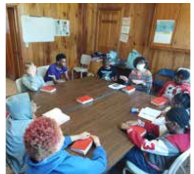
On Saturday, April 26th, Ambassadors and the Education Director revisited Delta Missions to assist with underprivileged youth.