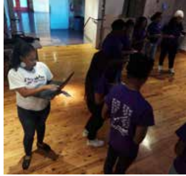
Concluding the first half of the program year, Ambassadors completed chapter reading assignments and presentations from the required reading, The Arrival of B.B. King by Charles Sawyer on Saturday, December 21st.