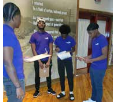
During the Saturday, January 11th meeting, the B.B.'s Bridge Building Ambassadors Youth Leadership participants completed MLK projects, were assigned reading assignment chapters, and practiced their docent scripts.