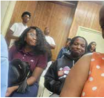
Ambassadors were privileged to observe first-hand how decisions and city business is conducted while attending Indianola City Board Meeting on Monday, October 28th.