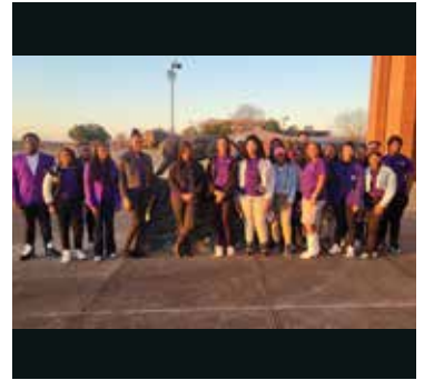
Ambassadors concluded Black History Month with attending a Step Afrika Performance at Coahoma Community College in Clarksdale on Tuesday, February 25th.